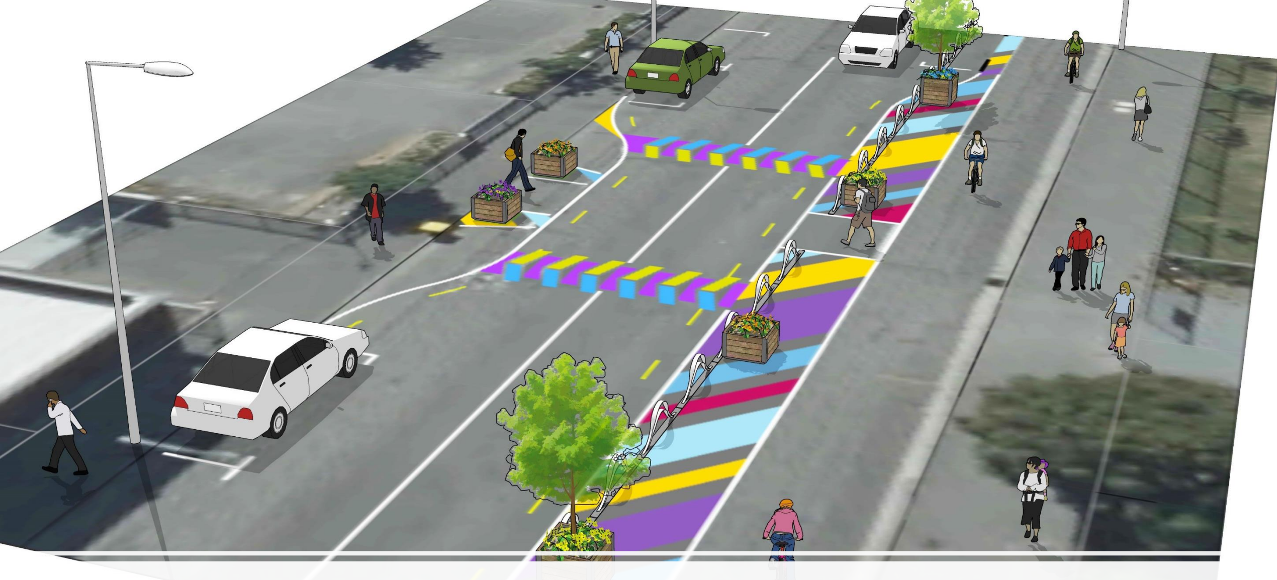
Innovating Our Streets – Ferry Rd