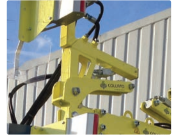
HYDRAULIC RAISE ON TOP BOARDS