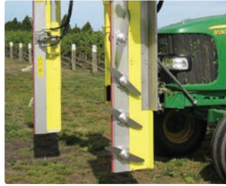
BOARD LENGTHS CUSTOMISED TO VINEYARD 0.78 - 2.0M