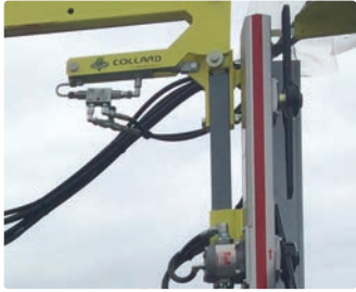
BOARD TILT FOR SLOPES