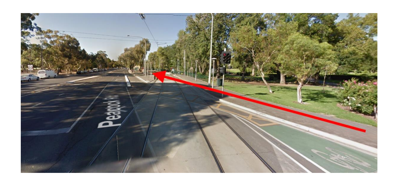
3. Hop off at 'stop tram Morphettville Racecourse', and proceed through the Morphettville Racecourse tram entrance, to the main building: