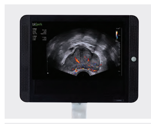
Superior image quality