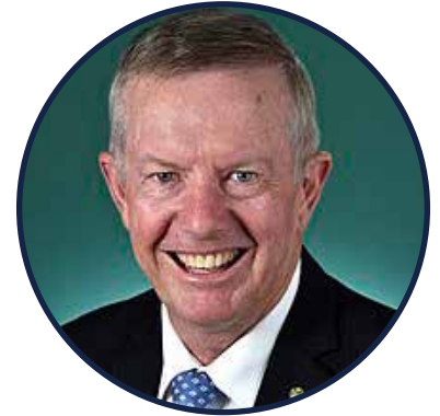
THE HON MARK COULTON MP Minister for Regional Health, Regional Communications and Local Government