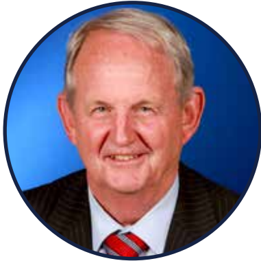
CR GREG CONKEY Mayor, Wagga Wagga City Council

Mayor Greg Conkey was first elected to the Wagga Wagga City Council in 2012 and in September 2016 was elected unopposed as Mayor, replacing Councillor Rod Kendall who served in the role for four years.