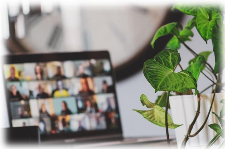
Conference Growth by Delegate Numbers

Note: Figures based off 2018 and 2019 conference delegate information