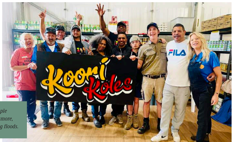
Pathfinders Pumpkin Run team and young people delivering pumpkins to the Koori Kitchen in Lismore, NSW after the 2022 Northern Rivers devastating floods.