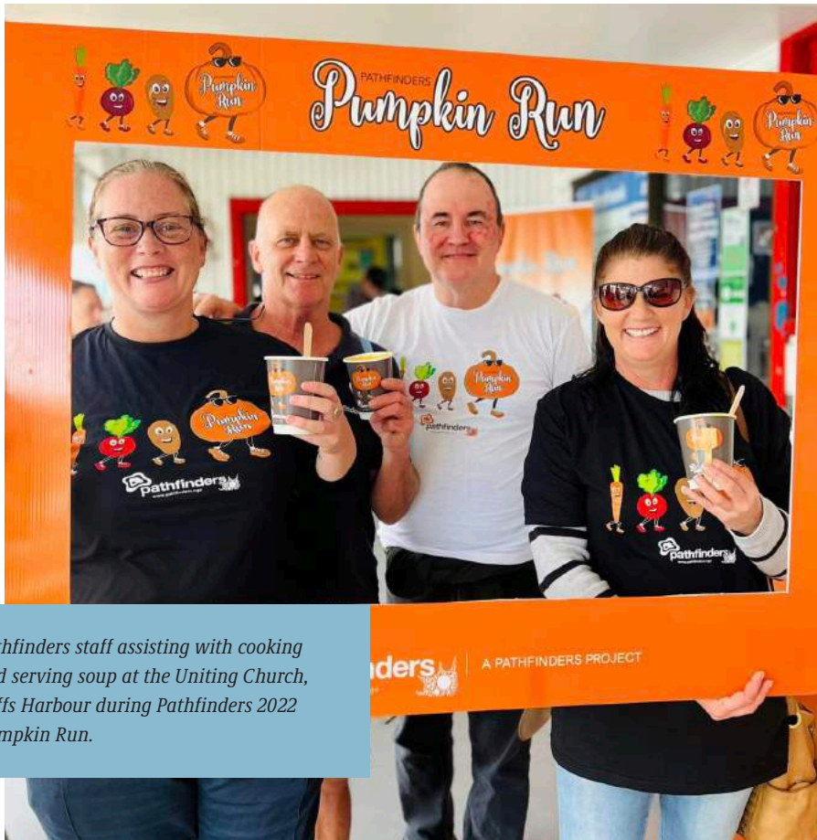
Pathfinders staff assisting with cooking and serving soup at the Uniting Church, Coffs Harbour during Pathfinders 2022 Pumpkin Run.