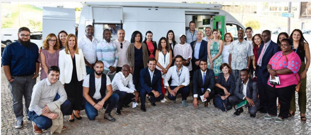
Photo gallery #1: Policy makers from all over the world meet to see how Portugal addresses hepatitis C in people who use drugs