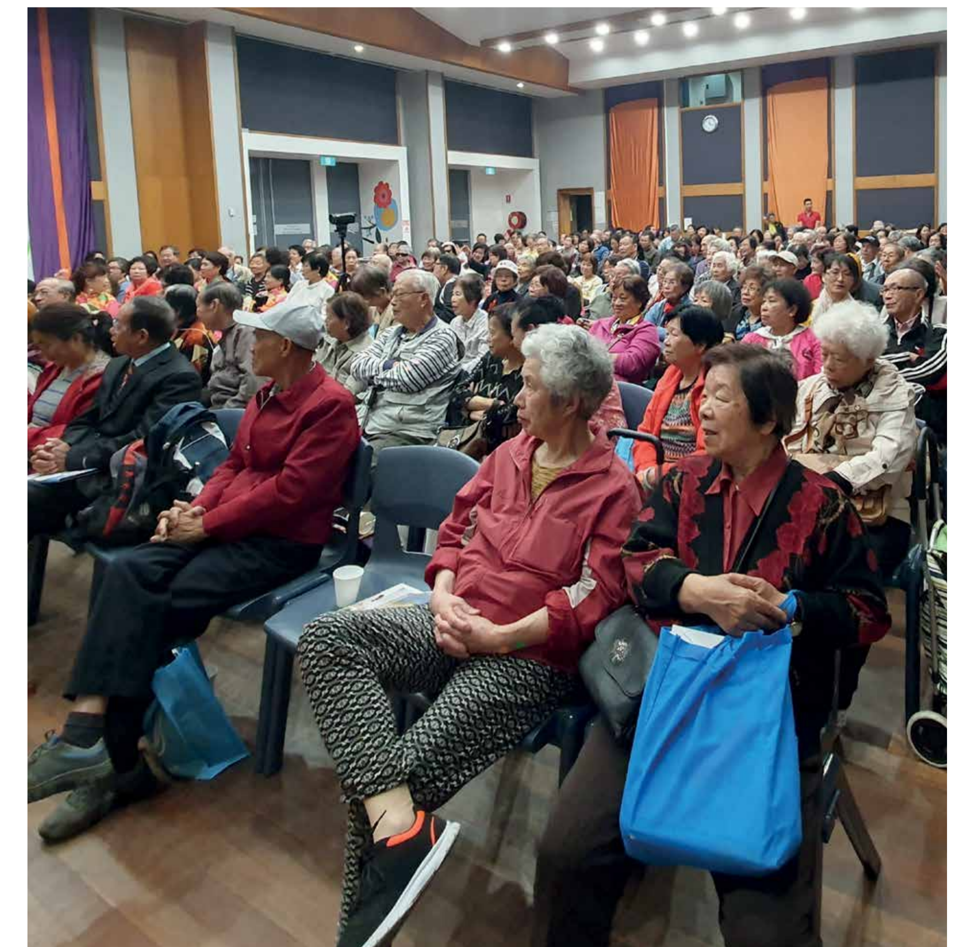
Chinese Seniors Health Gala at Ashfield Town Hall.