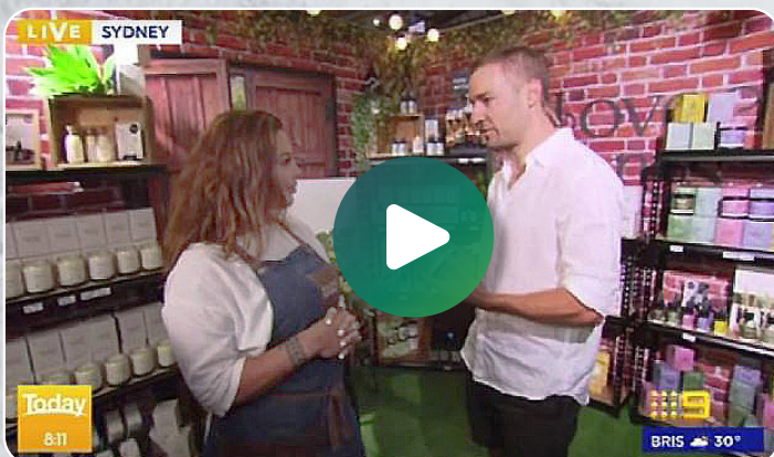
Australian Made licensee Beloved Scents interviewed on Channel 9 Today Show