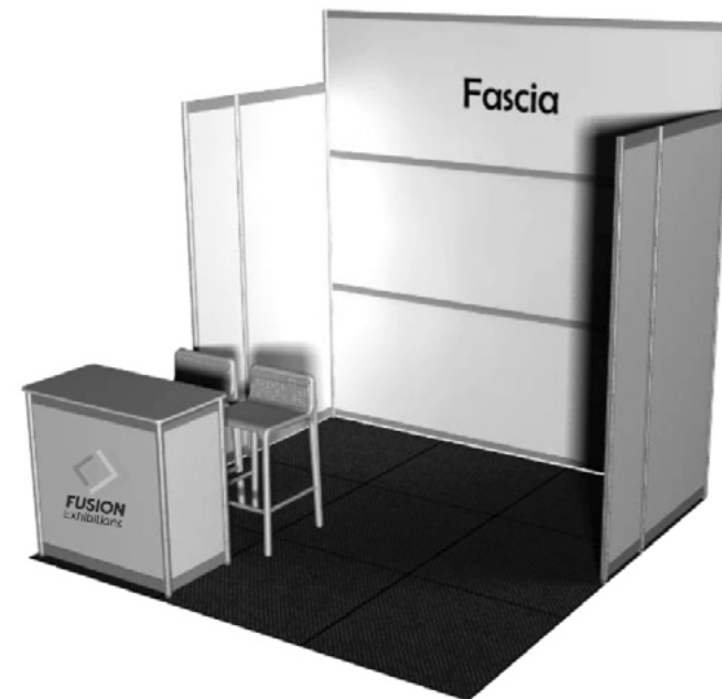
Example image only