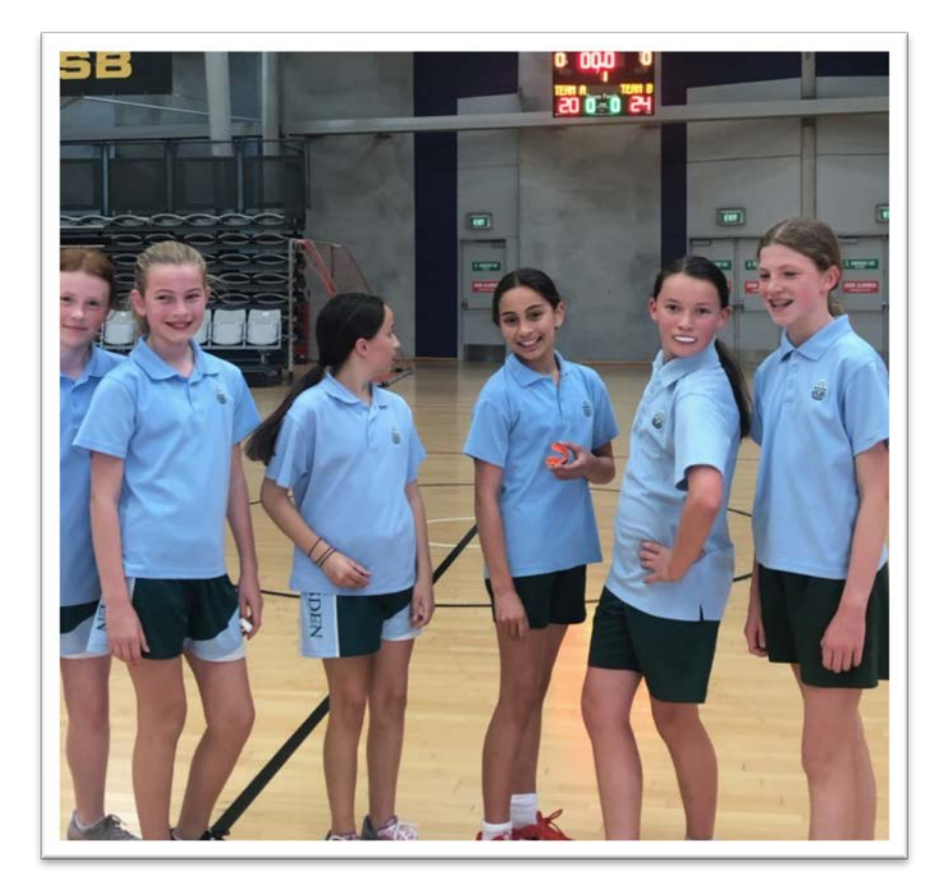
Hineteohorere: Oct 2019 celebrating B'Ball Win