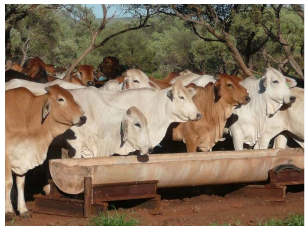
All prices are exclusive of GST.