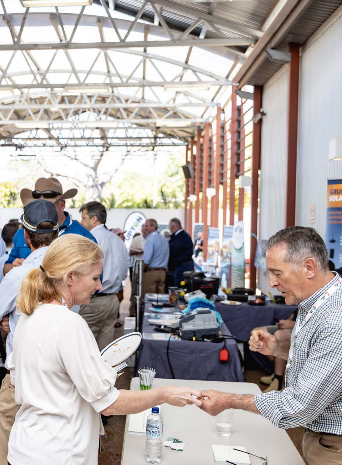
All prices are exclusive of GST.