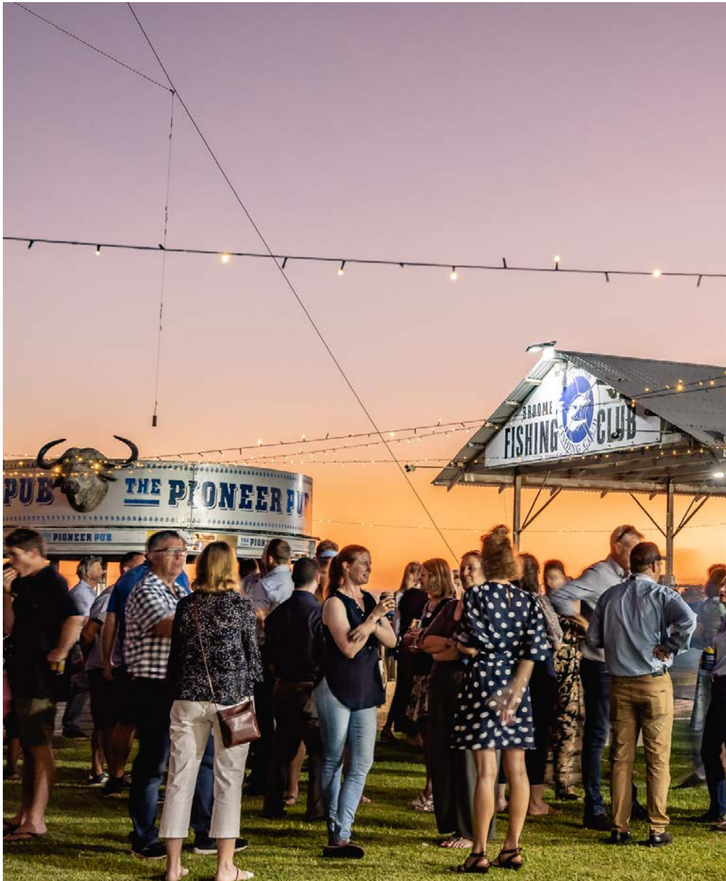
All prices are exclusive of GST.