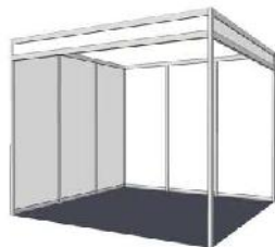
Corner booth image